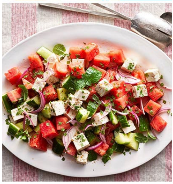
Watermelon, Cucumber and Feta Salad