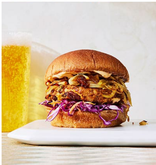
Smothered Black Soybean Burgers