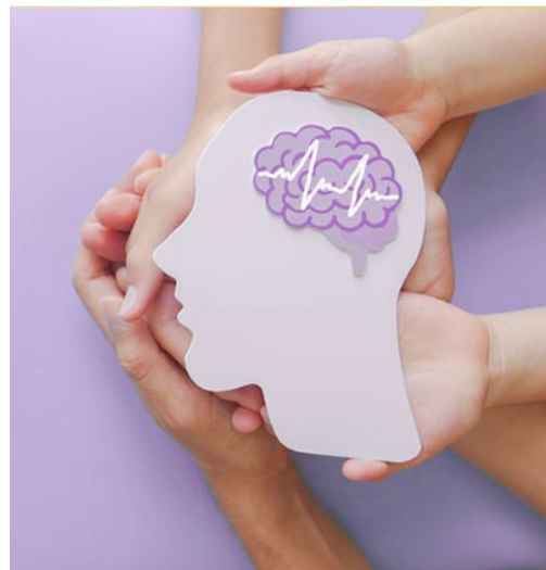
National Stroke Awareness Month