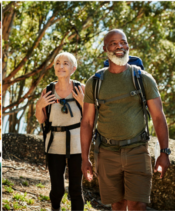
Living with Diabetes: Get Active!