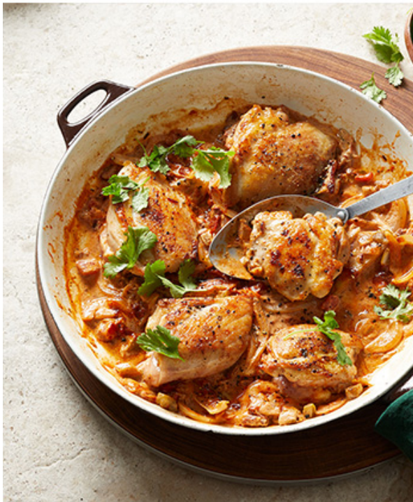
Creamy Chipotle Skillet Chicken Thighs