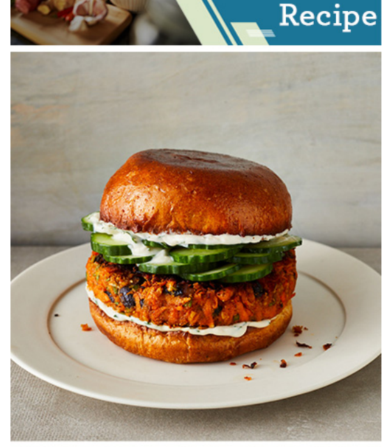
Sweet Potato Black Bean Burgers