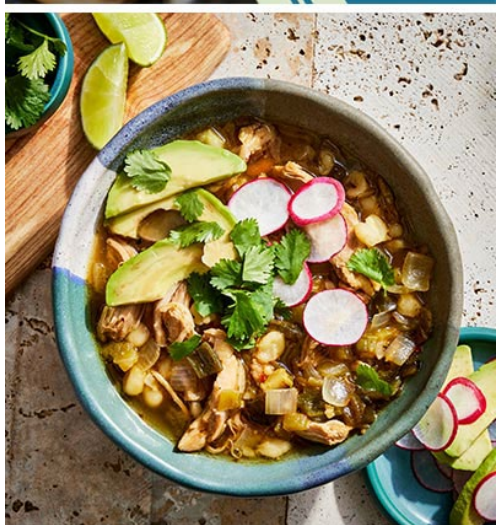
Green Chile Chicken Pozole