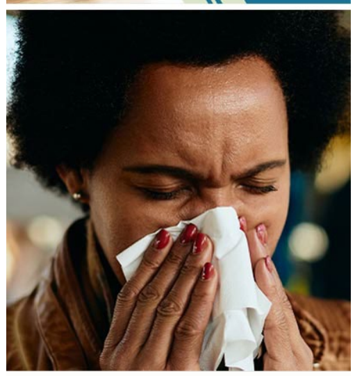
Prevent Seasonal Flu