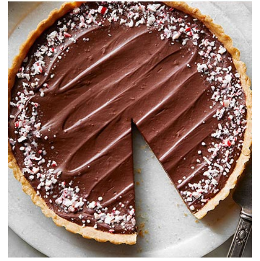
Peppermint Chocolate Tart