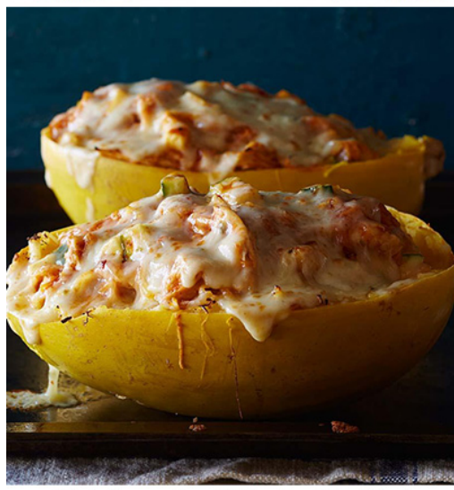
Chicken Enchilada-Stuffed Spaghetti Squash